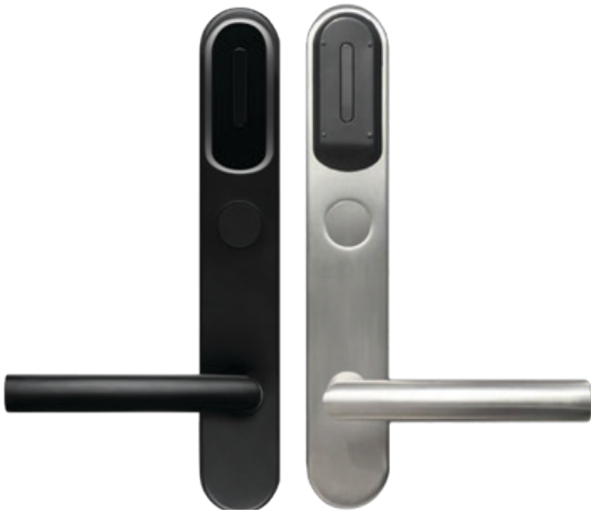
HOTEL DOOR LOCK